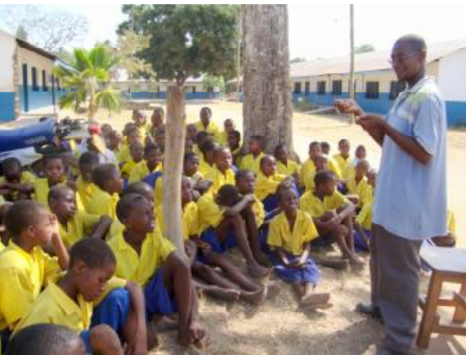
School awareness session

This is a very successful project initiated by a UK visitor and donor. The children who have been through the project and are now aware of blindness issues can now use their knowledge to bring us blind people in their community.