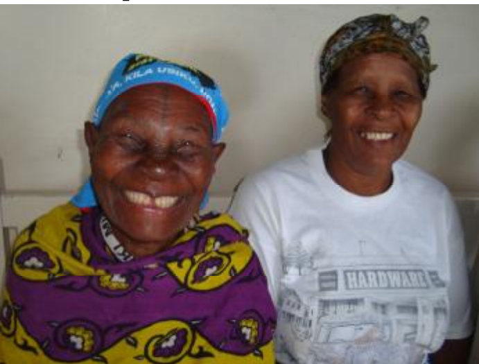
The smile—The gift of sight

To our astonishment our field programme found almost three times as many local people blind from cataract as we had expected!