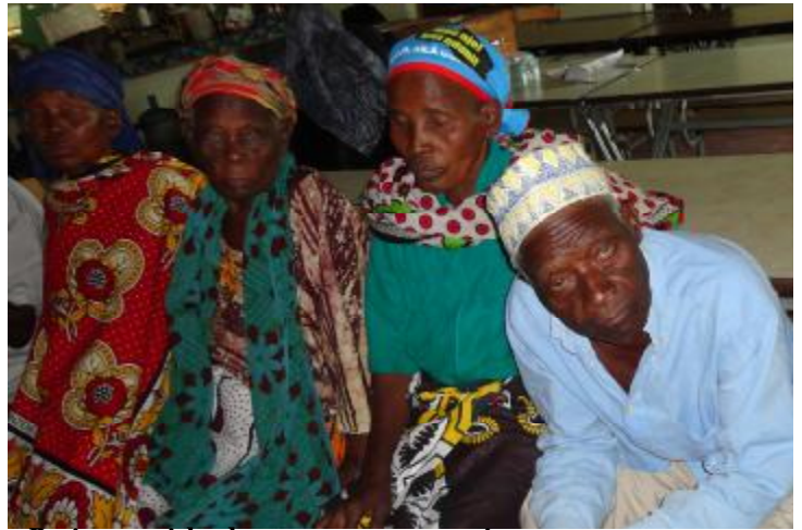
Patients with glaucoma at a screening

Glaucoma blinds irreversibly. It is crucial to reach the patients at risk as early as possible. Thanks to a UK donor, we have been able to double the number of glaucoma operations during this period.