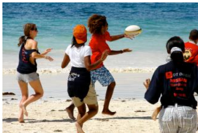
Battling Blindness- touch rugby for eyes

This fun charity sports event on Diani Beach raises money for Kwale District Eye Centre. Sports are football with a rugby ball, volley ball, Frisbee, water ball, an obstacle race and many others.