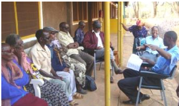
Patients at Taita Clinic learn how to look after their eyes after surgery

We have linked up with other medical services in the area at medical camps and are gradually getting the word out that there is now specialised eye care available nearby.