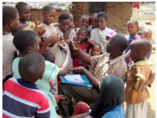
Deaf Blind officer teaching children how to communicate with a deaf/blind child from their village. This breaks their isolation

The little milestone developments in the lives of these children mean a lot. Community work is all about follow-up, counseling and sharing experiences and information for the benefit of the clients. This is difficult work.